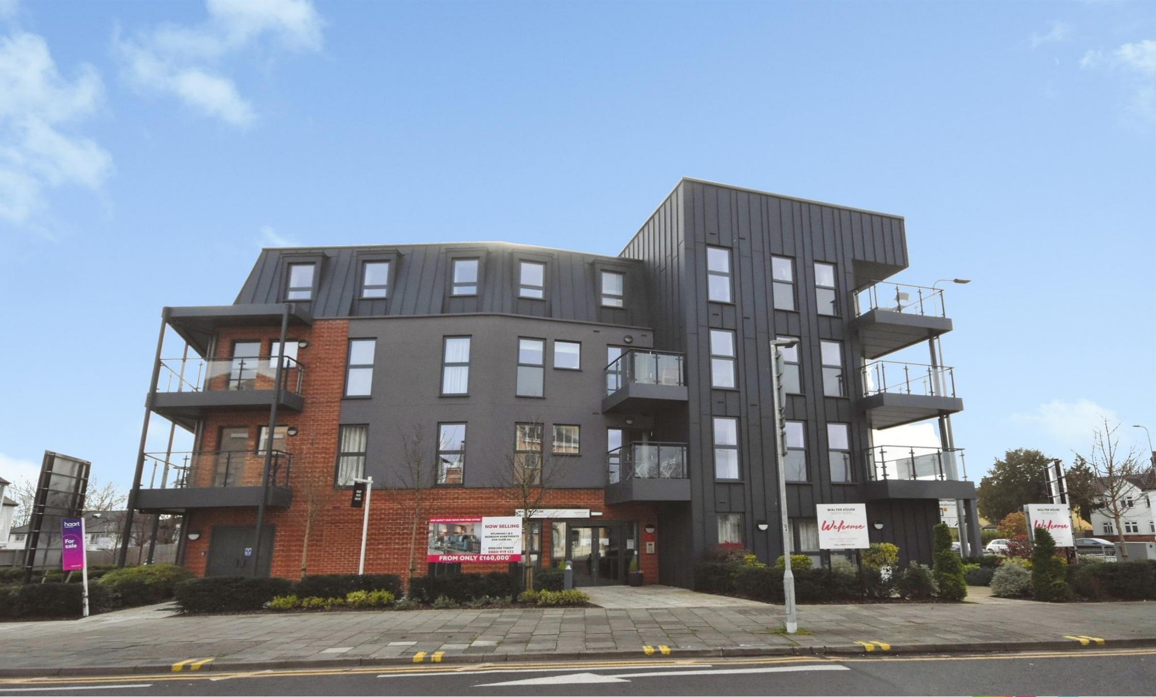
Walter House Rainsford Road, Chelmsford CM1 2XJ