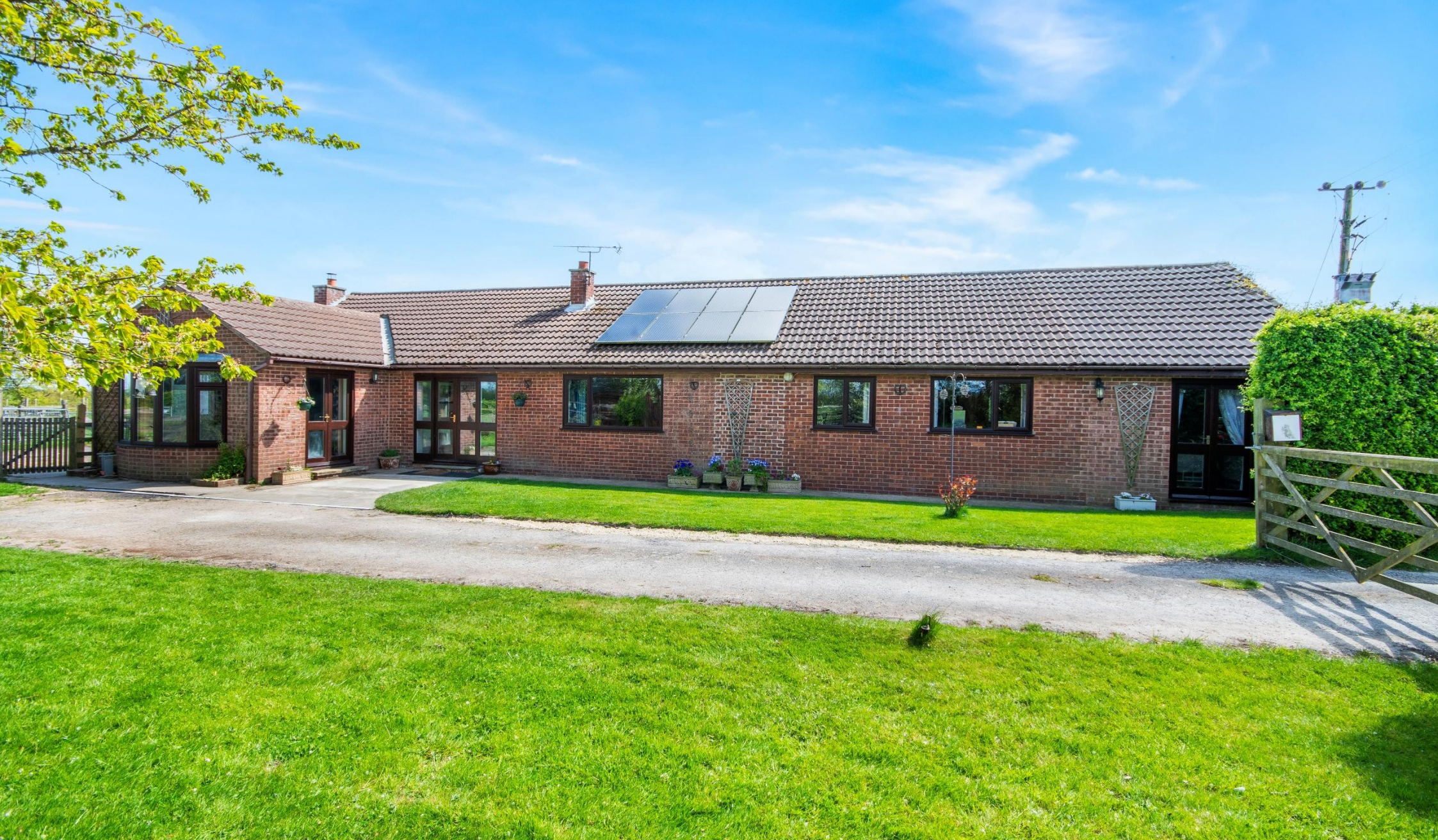
HAWKSLEY FARM BUNGALOW, UPTON £690,000