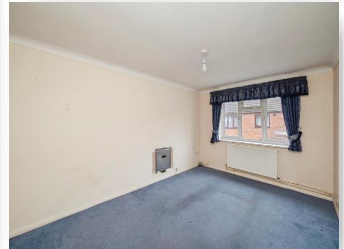
Hamilton Close, North Walsham NR28 0AQ