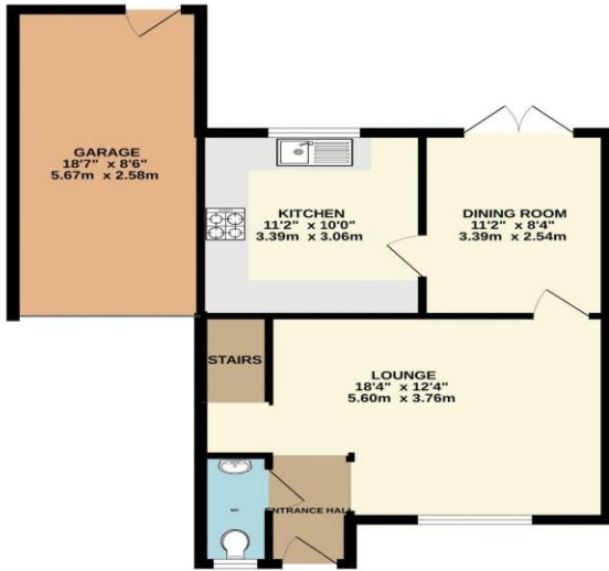
GROUND FLOOR 607 sq.ft. (56.4 sq.m.) approx.