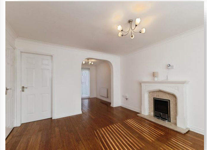
Finchlay Court, Middlesbrough TS5 8EL