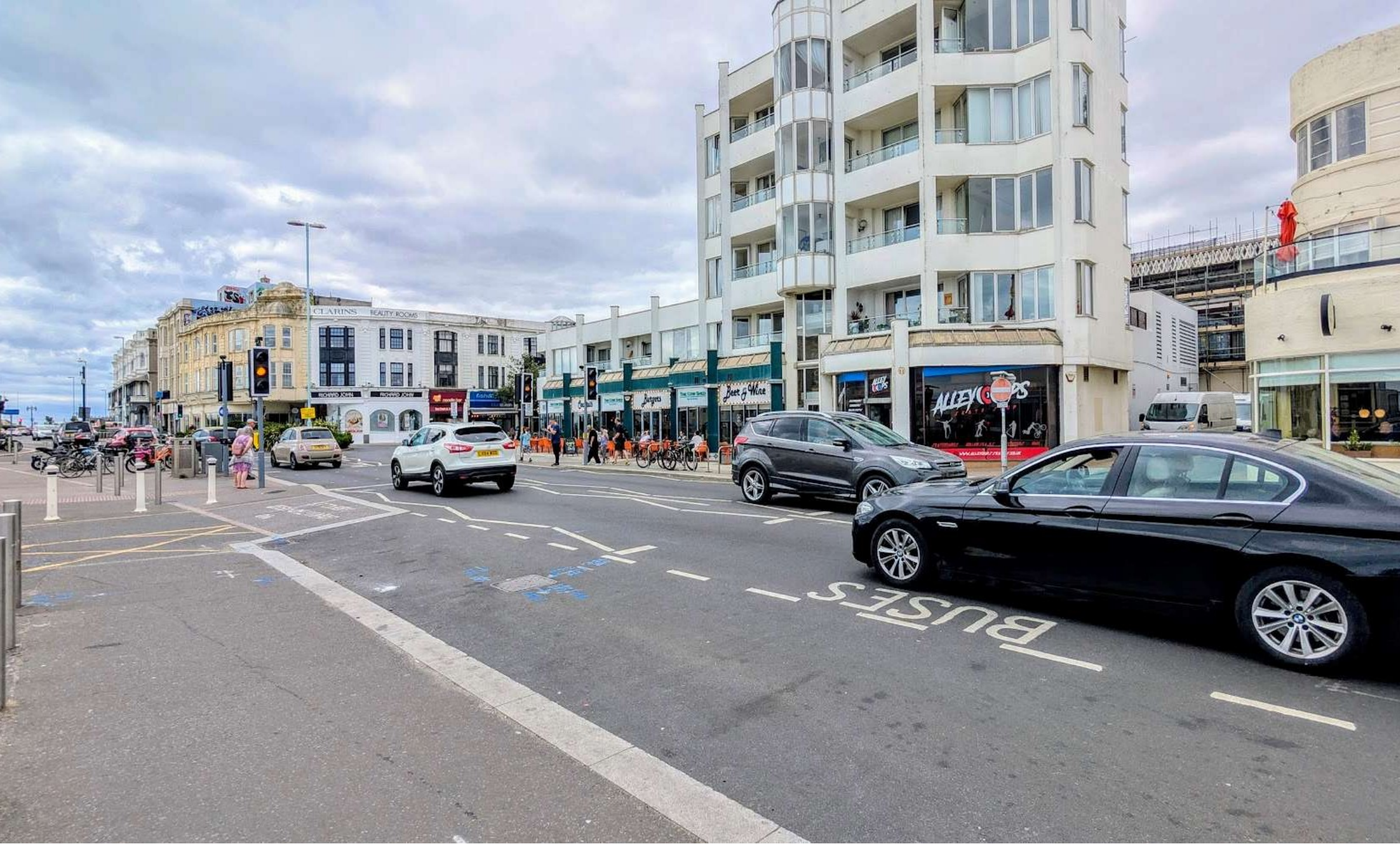
Seaspray Marine Parade, Worthing BN11 3PU