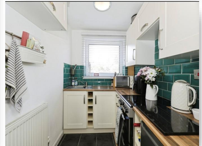
Bachelor Gardens, Harrogate HG1 3EL