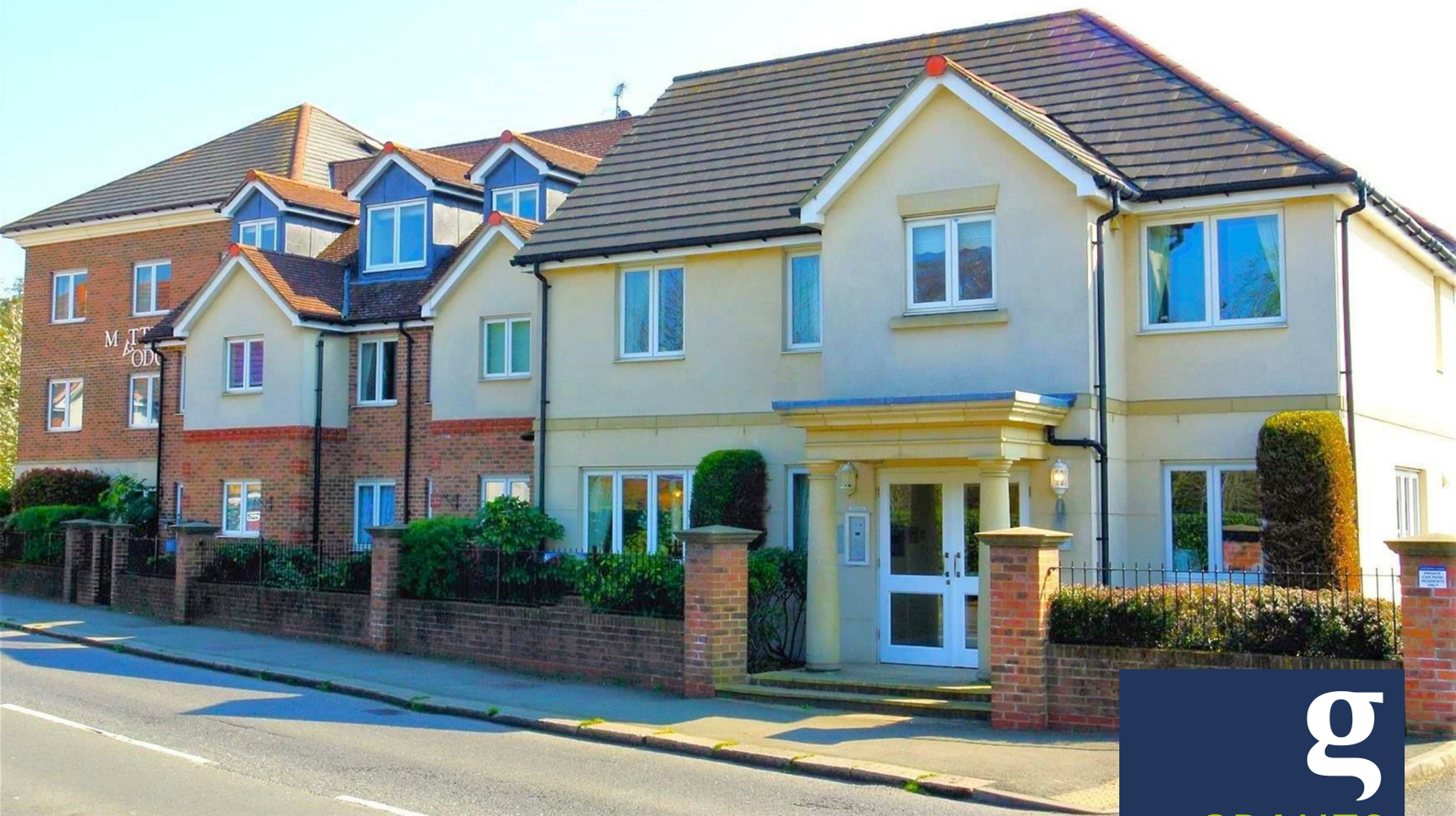
Matthews Lodge, Station Road, Addlestone, KT15 2FB