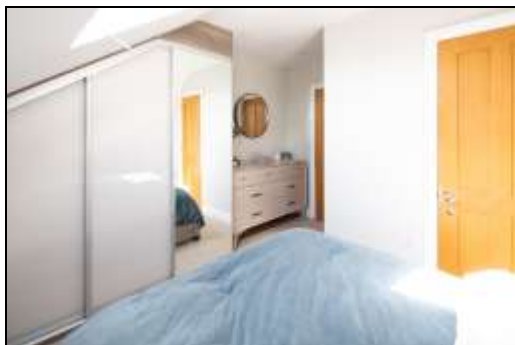
Second Floor Bedroom One