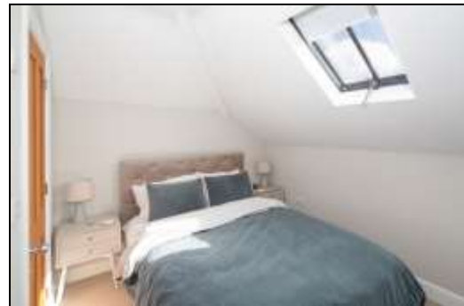
Second Floor Bedroom One