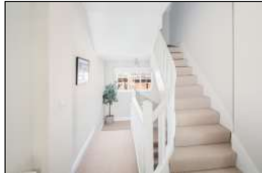
Landing and Staircase to Second Floor