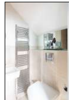
En-Suite to Bedroom One