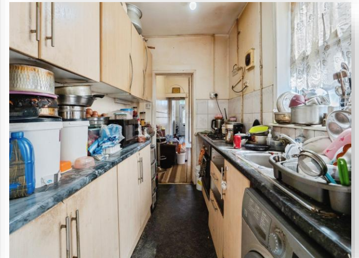
Farnham Street, Leicester LE5 3FL