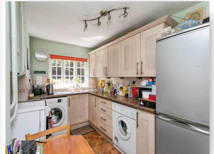
Emotwell Farmhouse, Petsoe End, Emberton, OLNEY, MK46 5JL