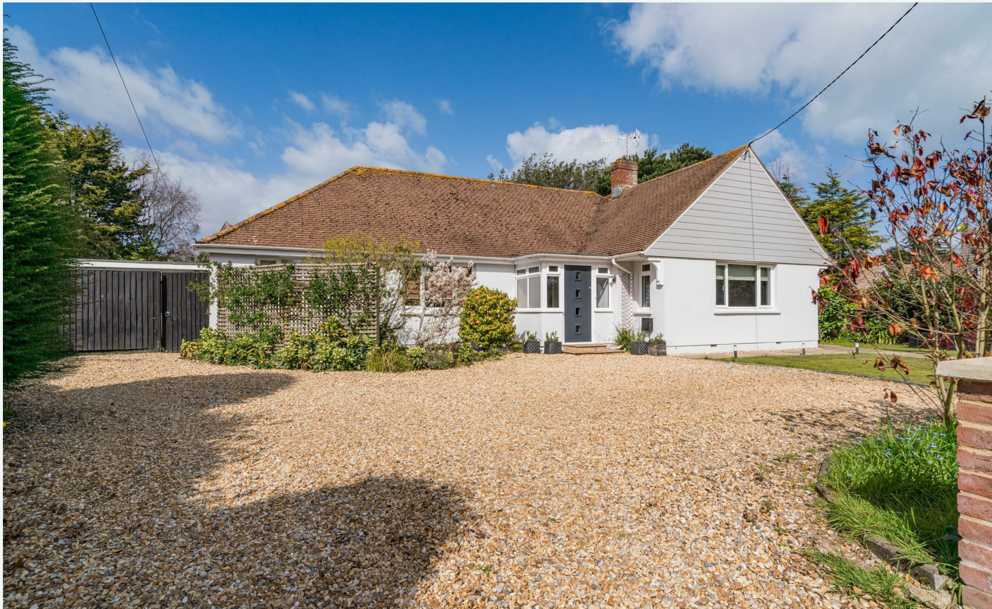
Little Haven, Swains Road, Bembridge, Isle Of Wight, PO35 5XR