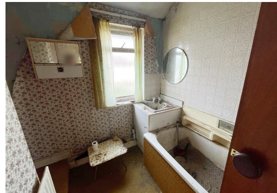
Bathroom 8'9" x 7'4" (2.69 x 2.26)