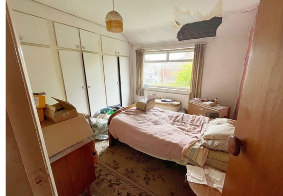
Bed 3 10'9" x 7'4" (3.28 x 2.24)