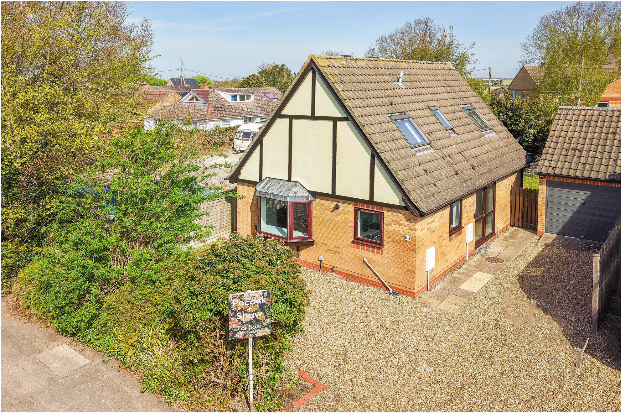
Toyse Lane, Burwell, Cambridgeshire