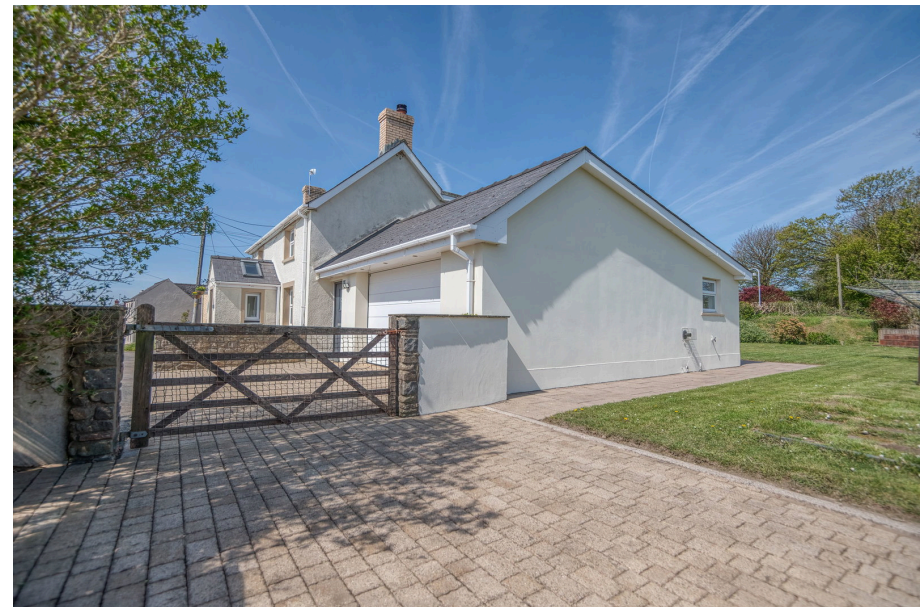
Bryndolwyn Little Newcastle Haverfordwest Pembs SA62 5TG

Approximate Gross Internal Area 1701 sq ft - 158 sq m