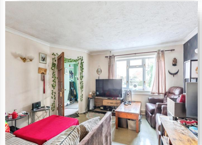
Nichols Way, Raunds NN9 6SB