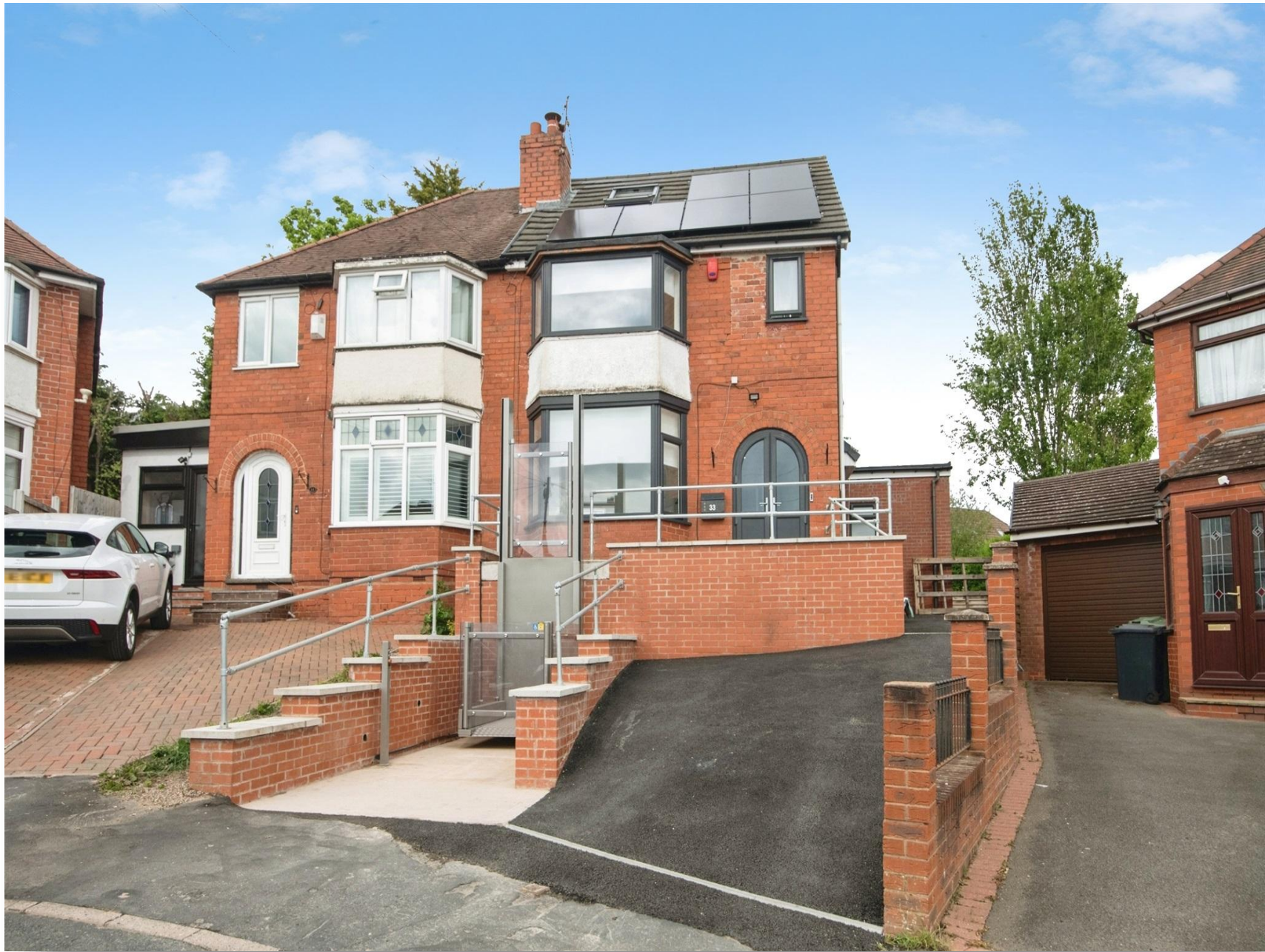
Sledmore Road, Dudley DY2 8DY