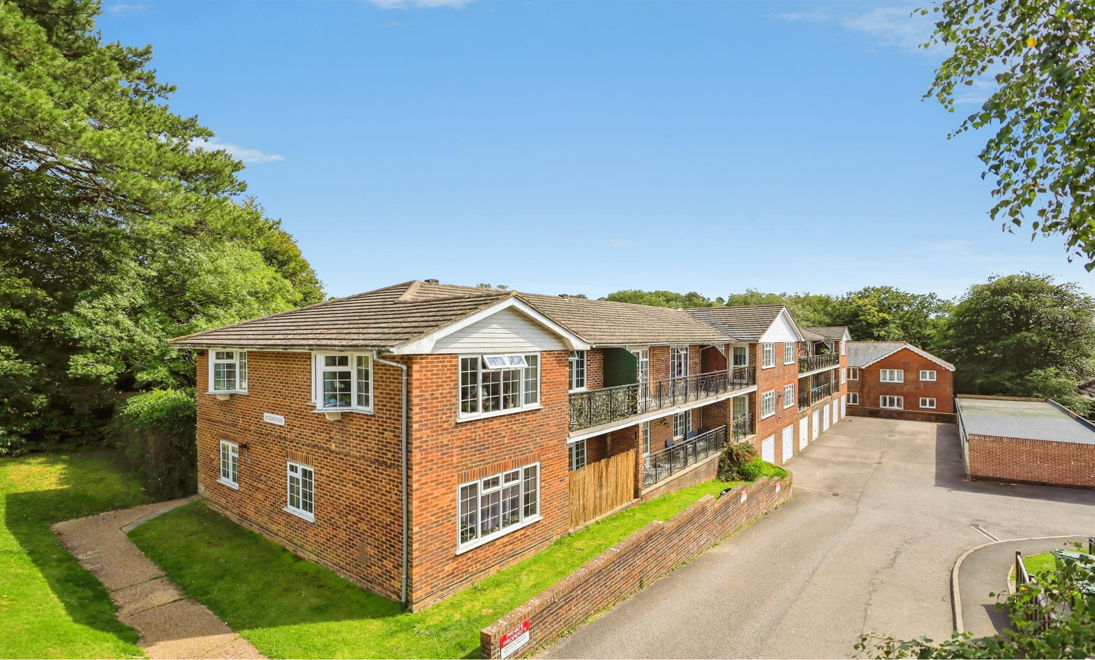
Milestones, Mutton Hall Hill, Heathfield TN21 8NE