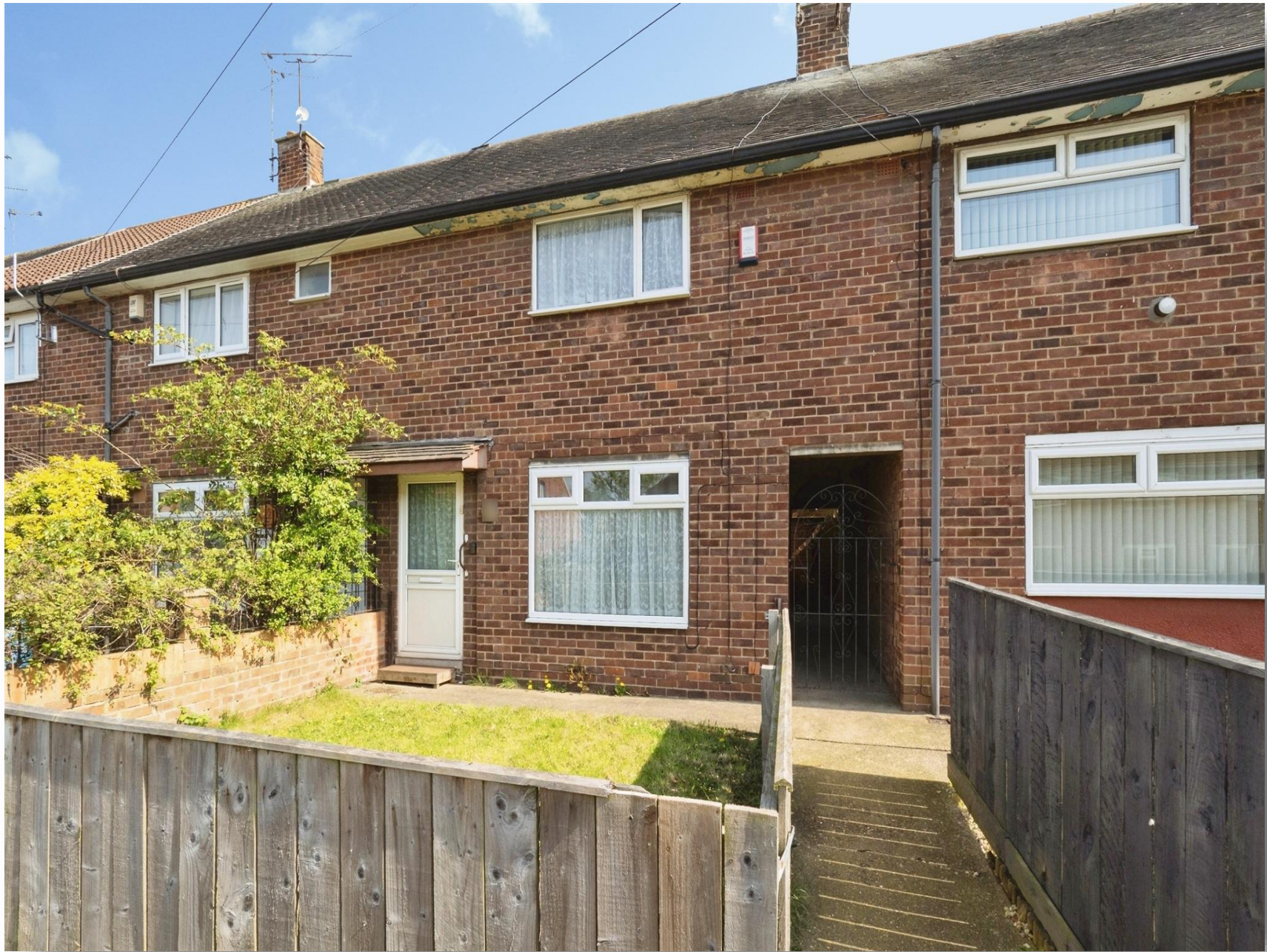
Waveney Road, Hull, HU8 9LZ