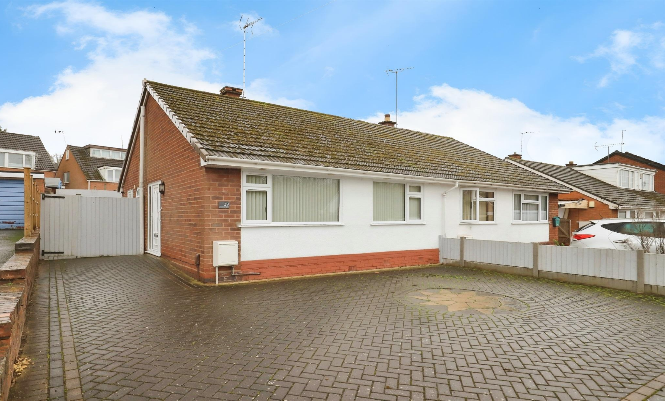
Lyndhurst Drive, Kidderminster DY10 2PT

Not for marketing purposes INTERNAL USE ONLY