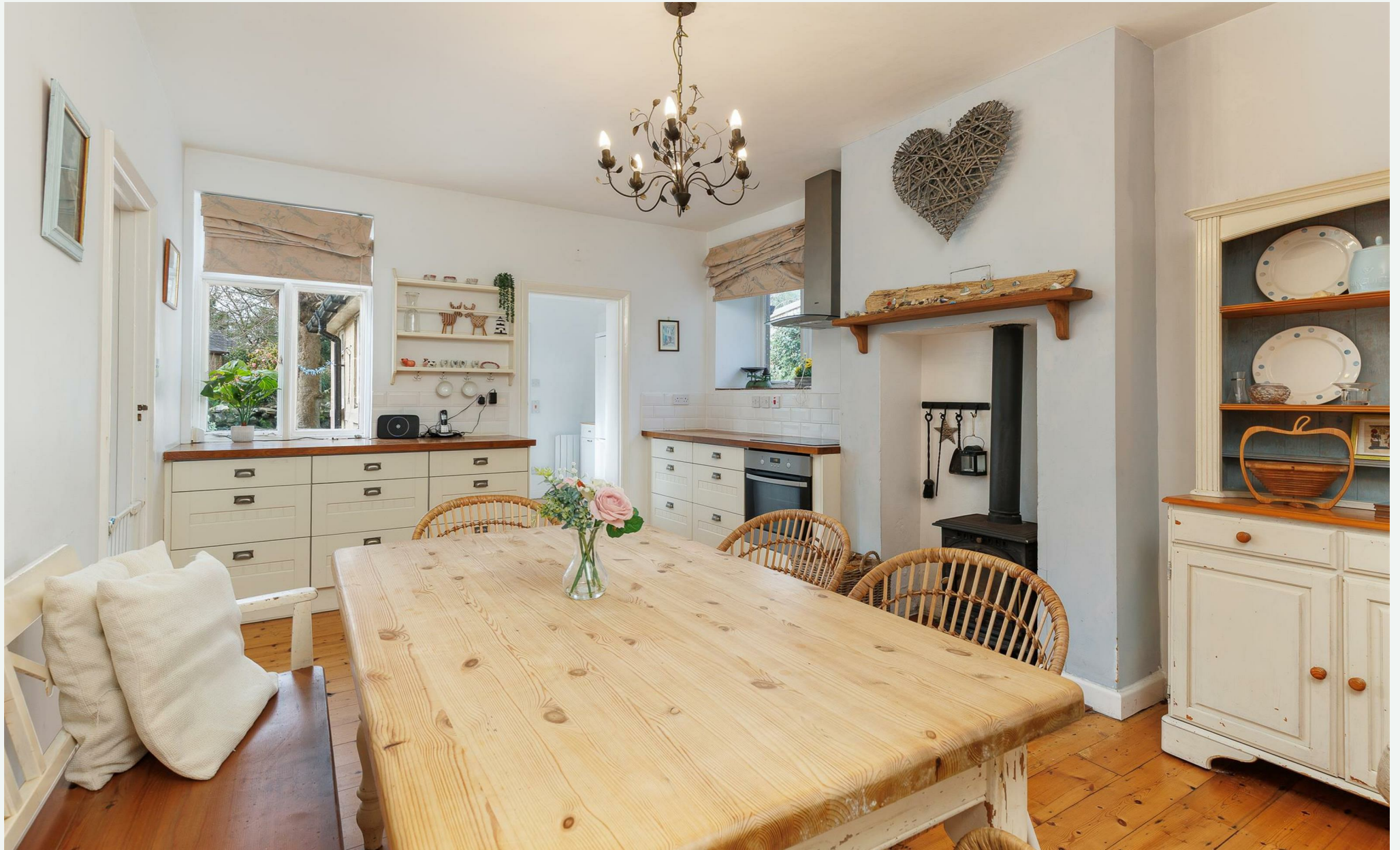
Elm Cottage, Woolverton Road, St Lawrence, Isle of Wight