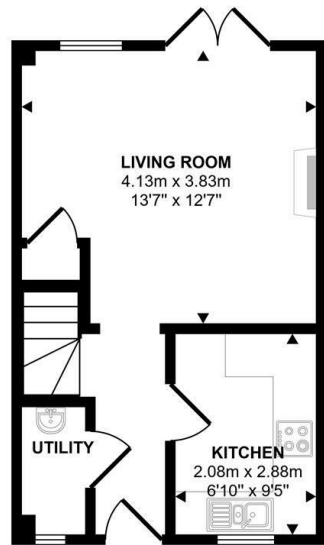
Ground Floor Approx 29 sq m / 310 sq ft

Approx Gross Internal Area 70 sq m / 756 sq ft