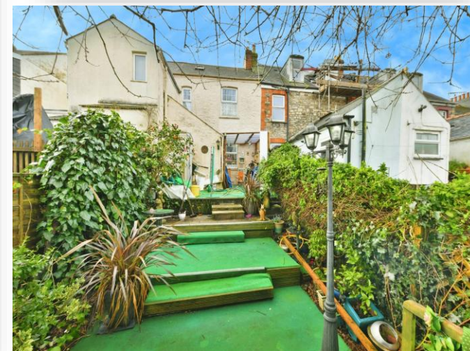
Underwood Road, Plymouth PL7 1TA