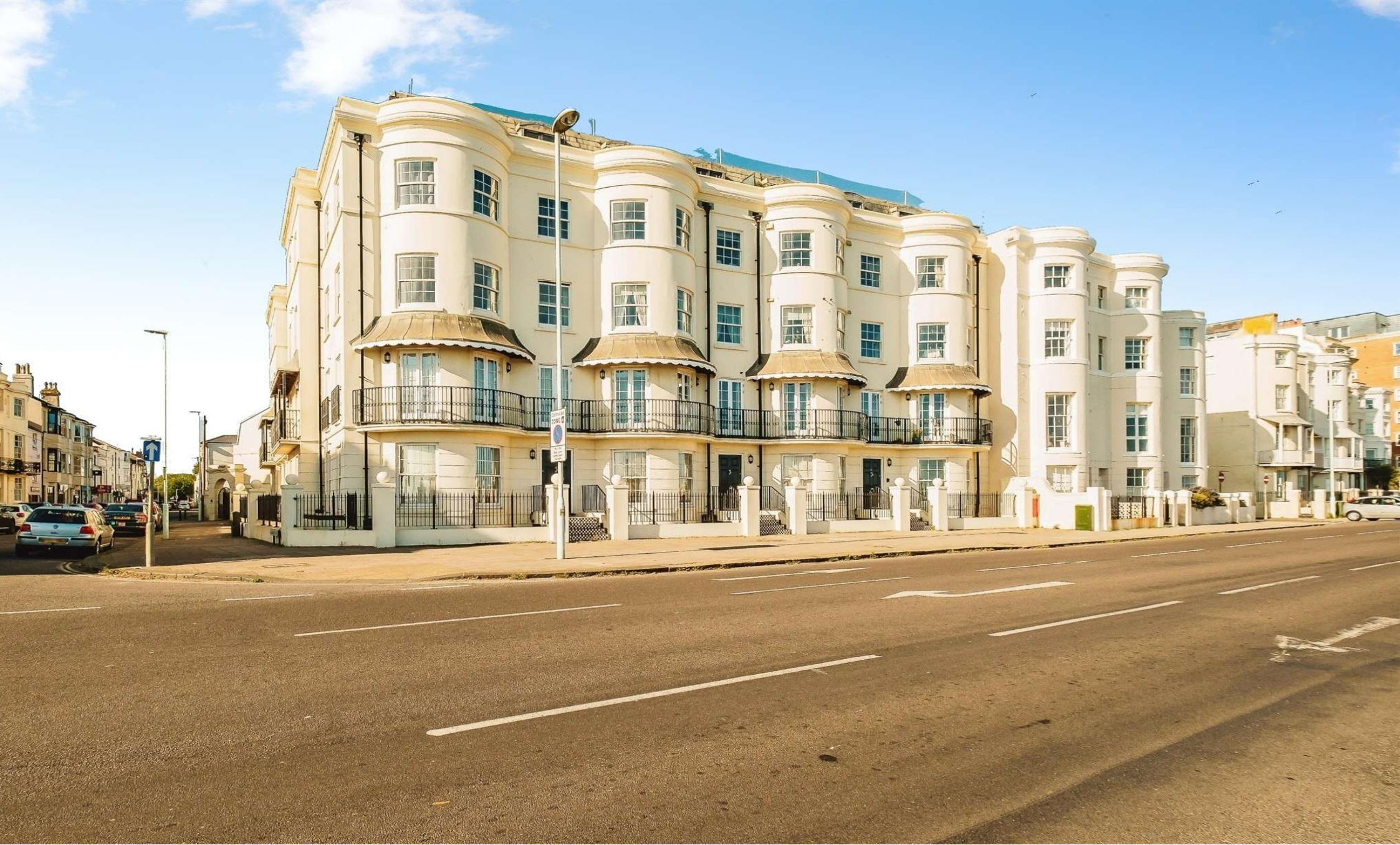
Nautilus Marine Parade, Worthing BN11 3PR