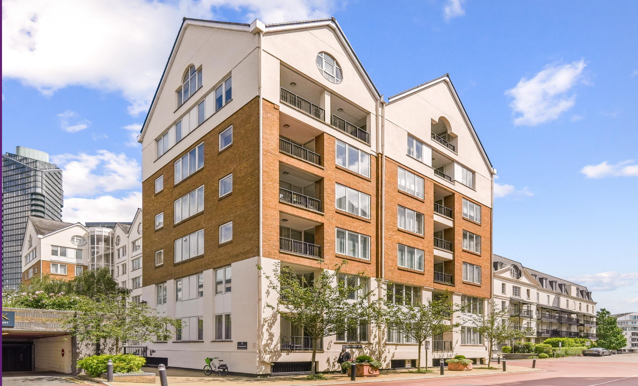
The Quadrangle Chelsea Harbour, SW10