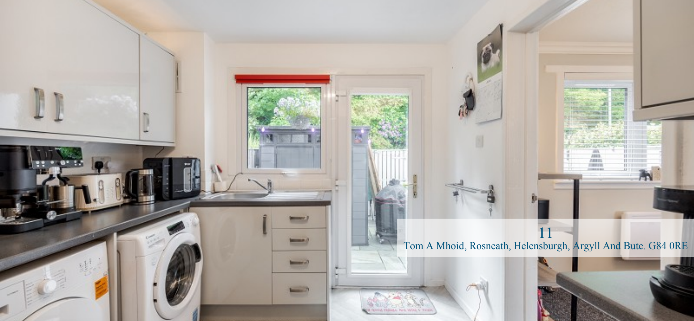
11 Tom A Mhoid, Rosneath, Helensburgh, Argyll And Bute. G84 0RE