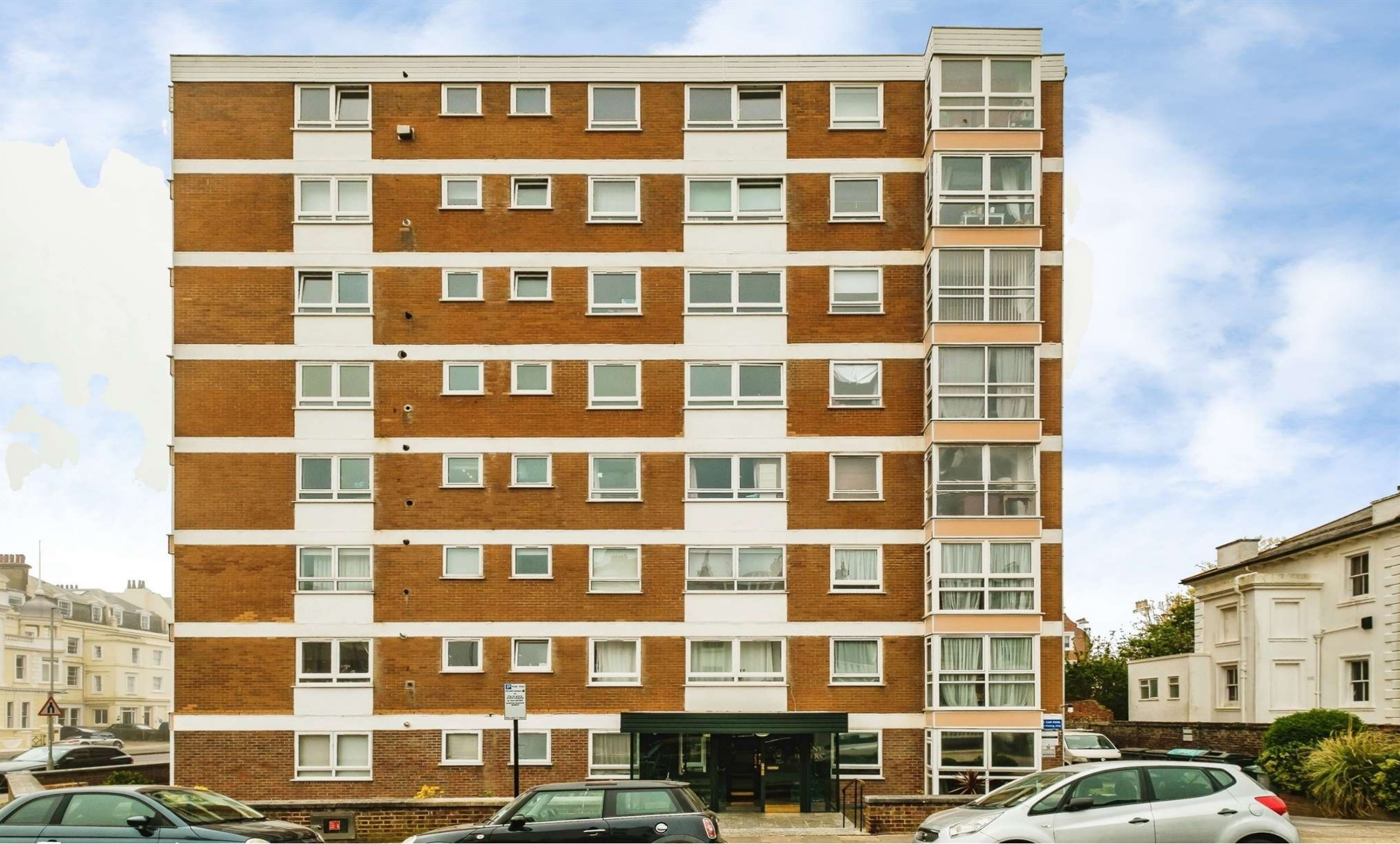
Albany Towers St. Catherines Terrace, Hove BN3 2RQ