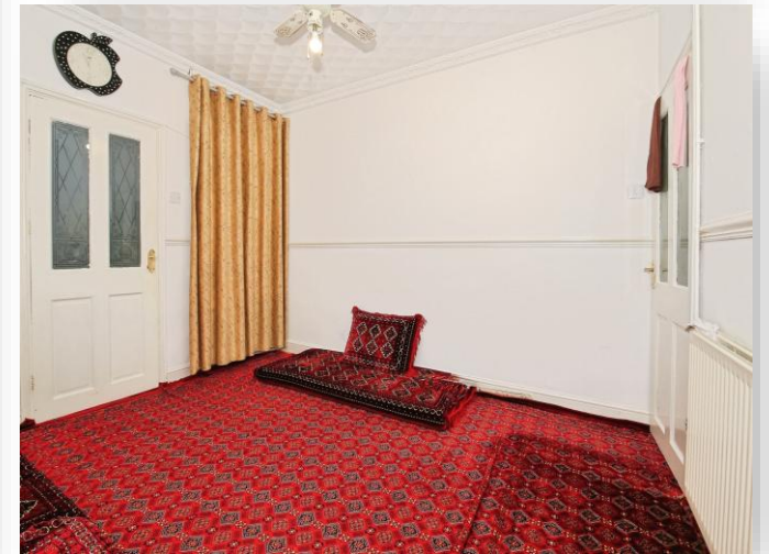
Gladstone Street, Peterborough PE1 2DD