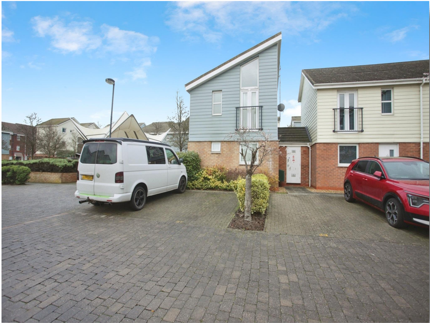
Follager Road, Rugby CV21 2JF