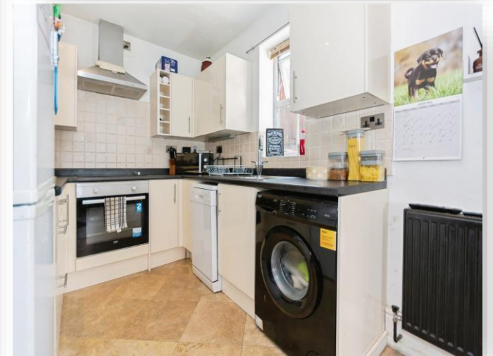
Selsey Road, Birmingham B17 8JN