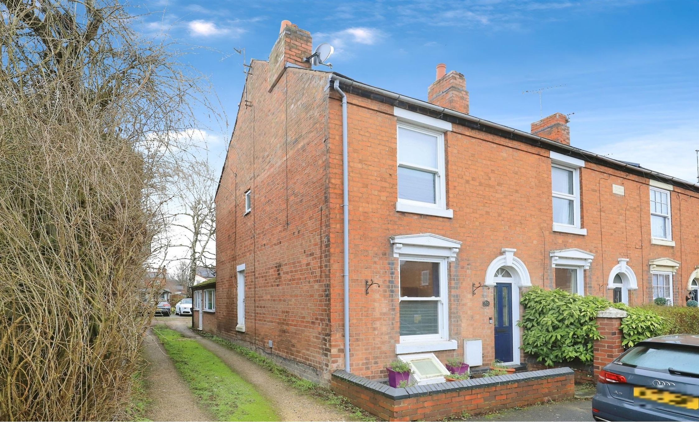
Shrubbery Street, Kidderminster DY10 2QY

Not for marketing purposes INTERNAL USE ONLY