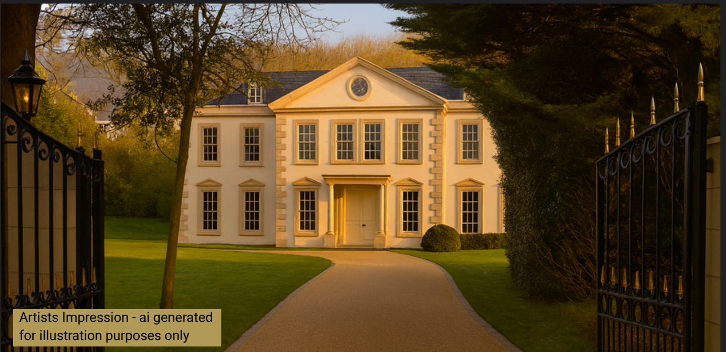
Artists Impression - ai generated for illustration purposes only

Set just off Victoria Road at the end of a quiet and secluded cul-de-sac, Tower End occupies a private plot of approximately 0.53 acre with its rear boundary directly backing onto Formby Golf Course and framed by mature pine trees.