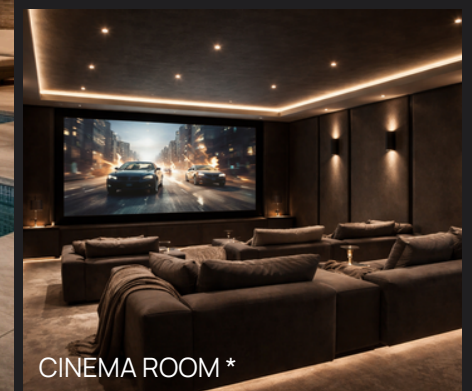
CINEMA ROOM *