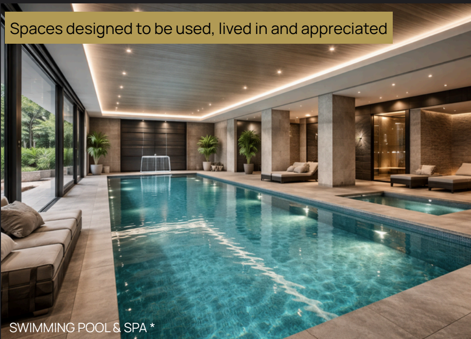
SWIMMING POOL & SPA *

Spaces designed to be used, lived in and appreciated