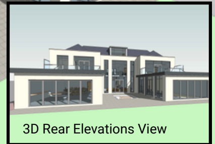
3D Rear Elevations View

While planning consent is secured, there remains scope to tailor the interior layout and finishes, offering the ability to personalise the home without revisiting the fundamentals. The design provides a strong platform for a home with lasting appeal, in terms of lifestyle and future value.