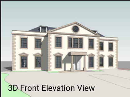
3D Front Elevation View