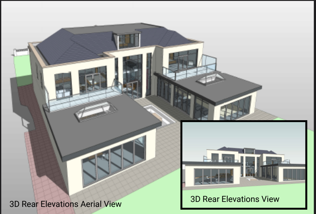
3D Rear Elevations Aerial View