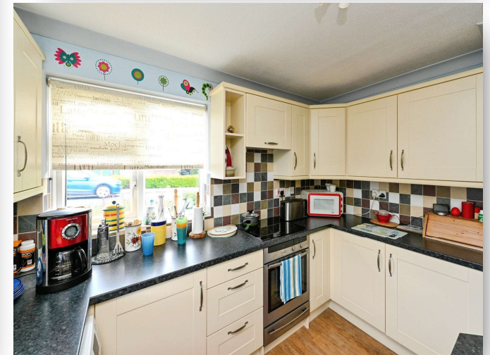
Beech Road, Downham Market, PE38 9PH