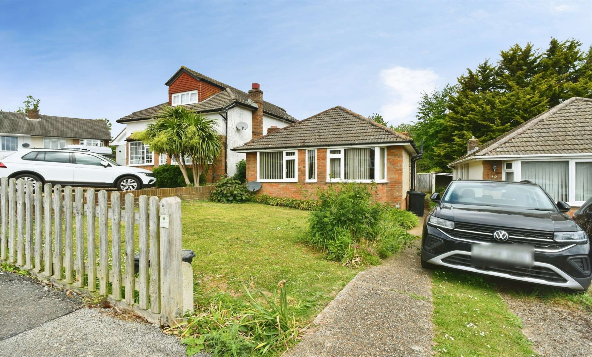
Westway Gardens, Portslade Brighton BN41 2RU