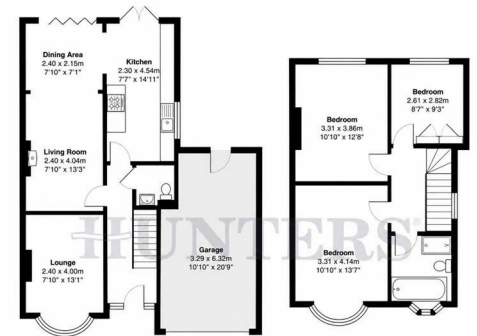
Manor Close, Worcester Park Total Area: 90.3 m 2 ... 972.16' (excluding garage)