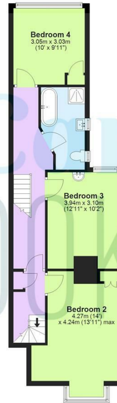
First Floor Approx. 58.0 sq. metres (623.9 sq. feet)