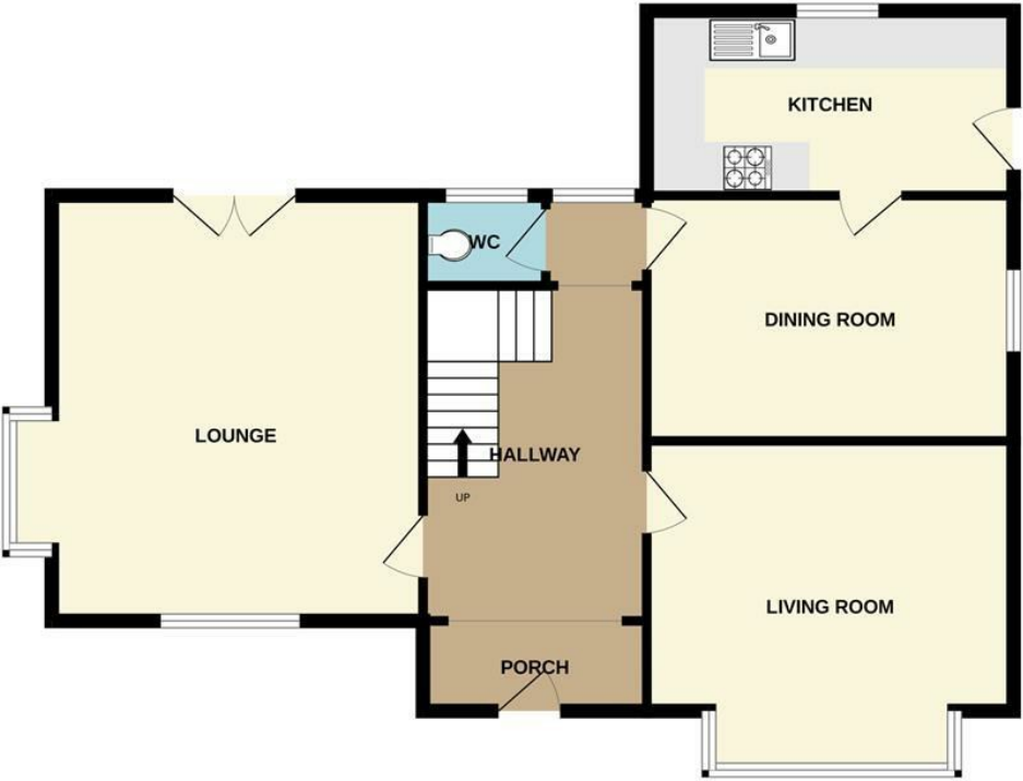
GROUND FLOOR 898 sq.ft. (83.4 sq.m.) approx.