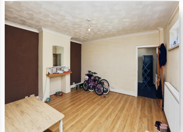
Coombe Road, Gosport PO12 4JB