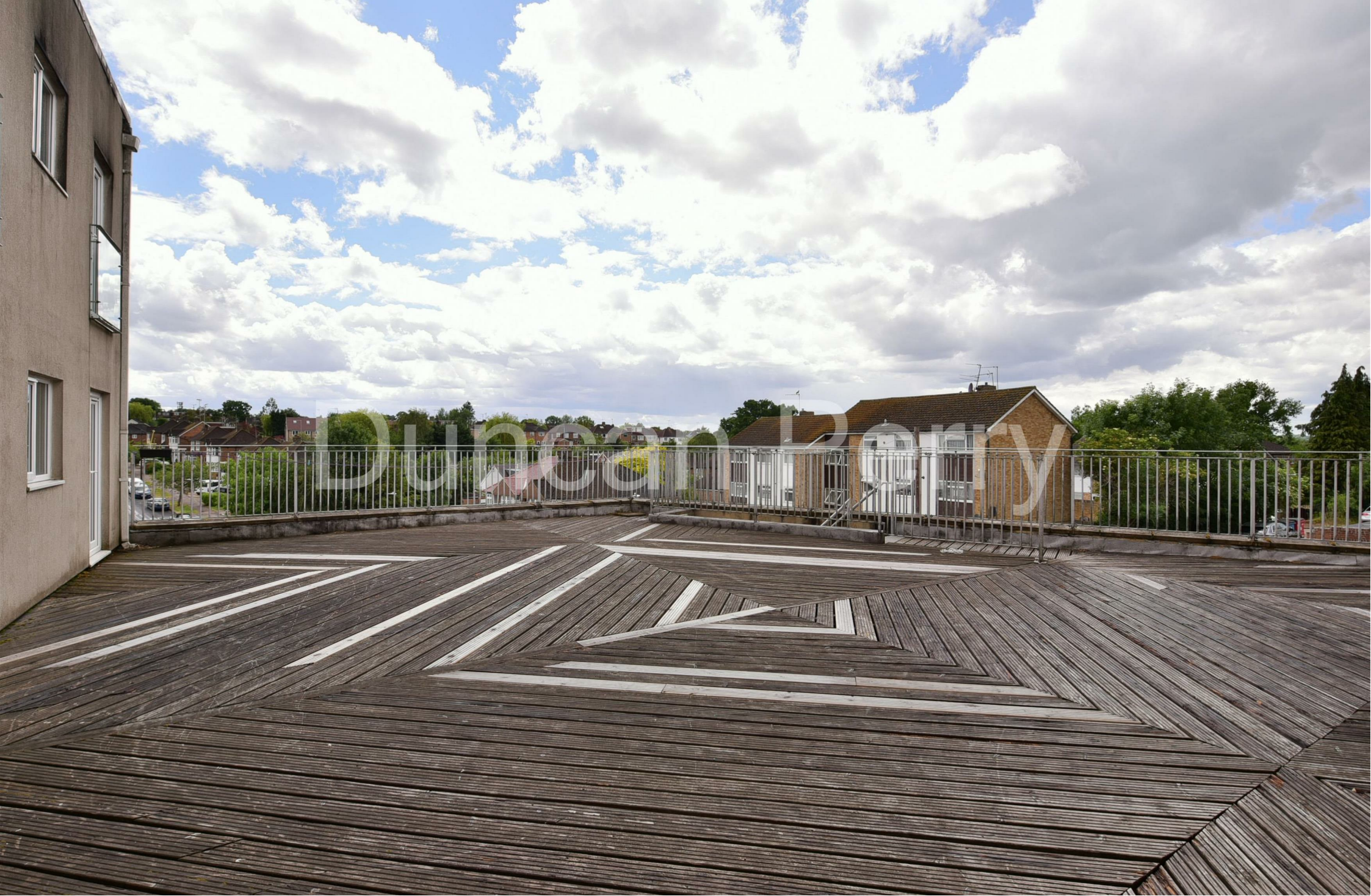
Orchard Court Mimms Hall Road, Potters Bar, EN6 3DW