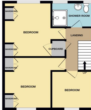
FIRST FLOOR 476 sq.ft. (44.3 sq.m.) approx.