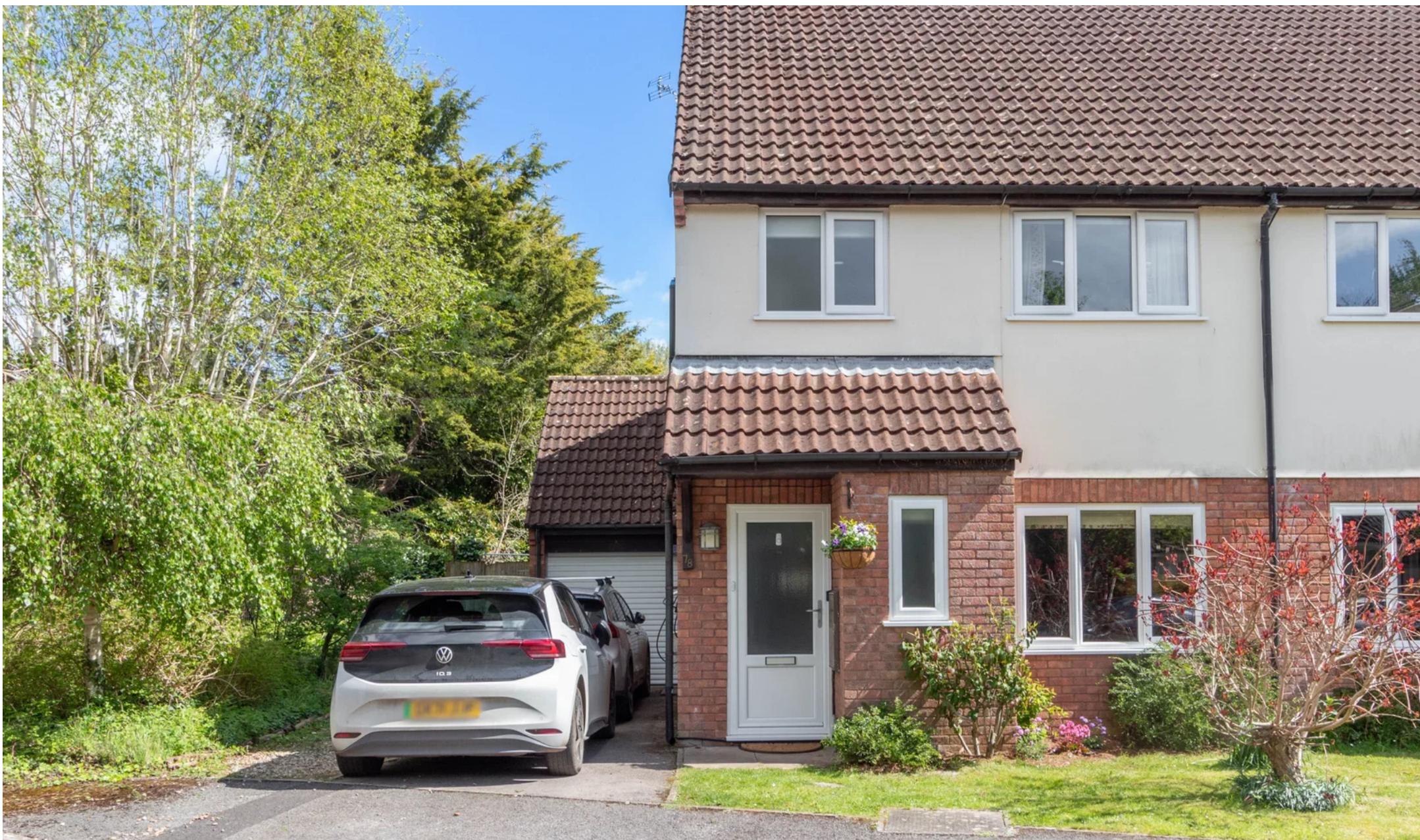
The Glebe, Wroughton £425,000