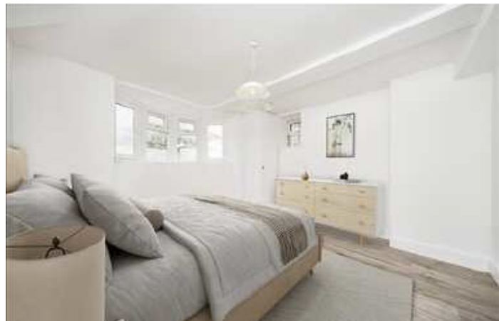
High Street, KT1