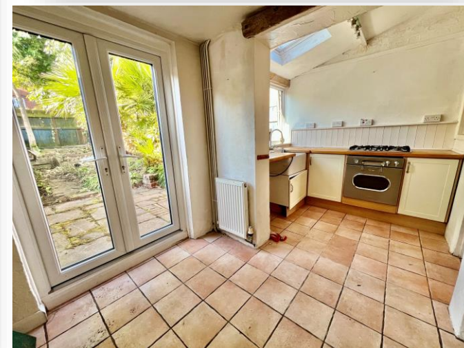
Victoria Road, Mundesley Norwich NR11 8JG