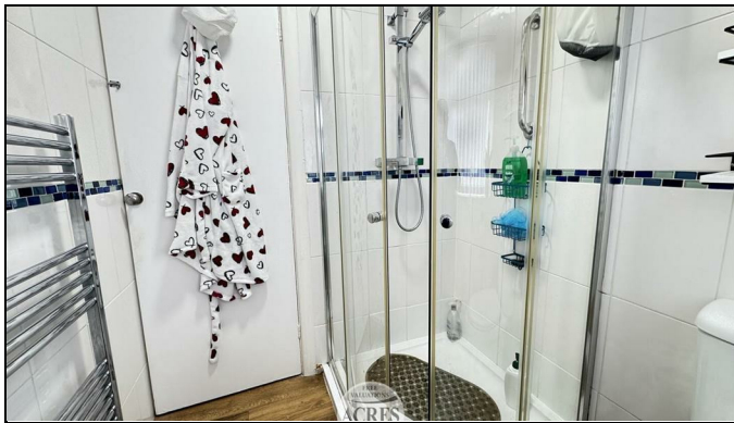
Cramlington Road, Great Barr, B42 2EG