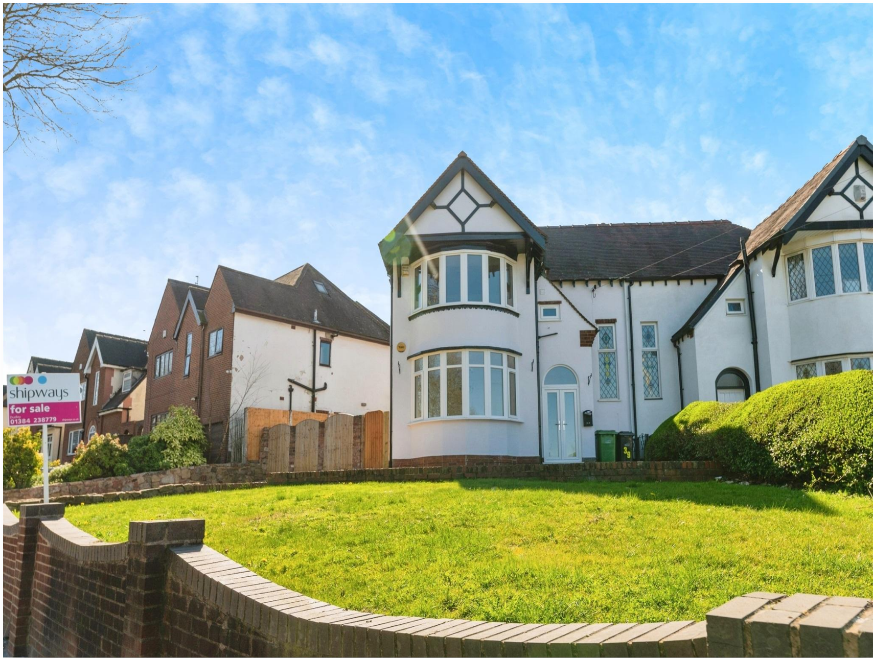
Priory Road, Dudley DY1 4EY