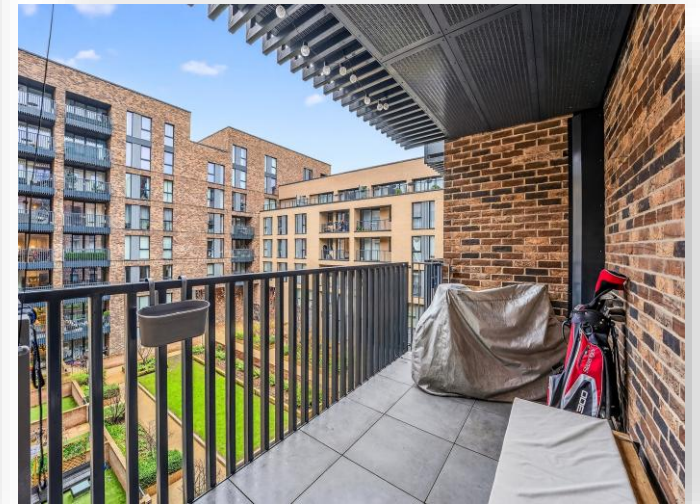
Mauger Heights, Summerstown, London SW17 0GZ