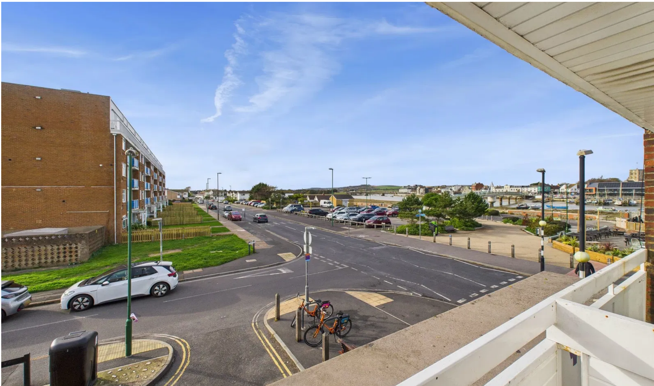
Ferry Road, Shoreham by Sea £250,000