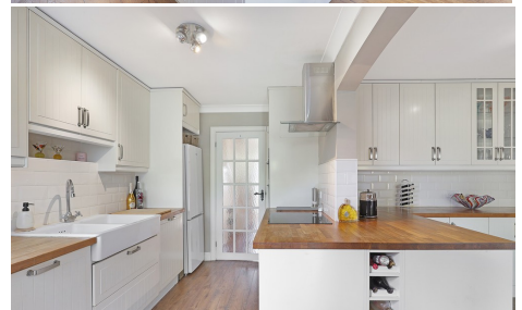
17 The Magpies Epping Green, Essex, CM16 6QG