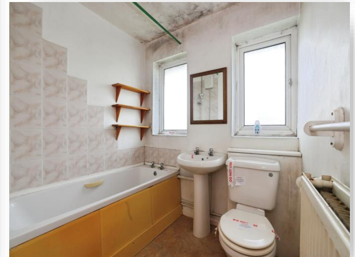
6 Wilson House Sidbury Heights, Tidworth SP9 7HU