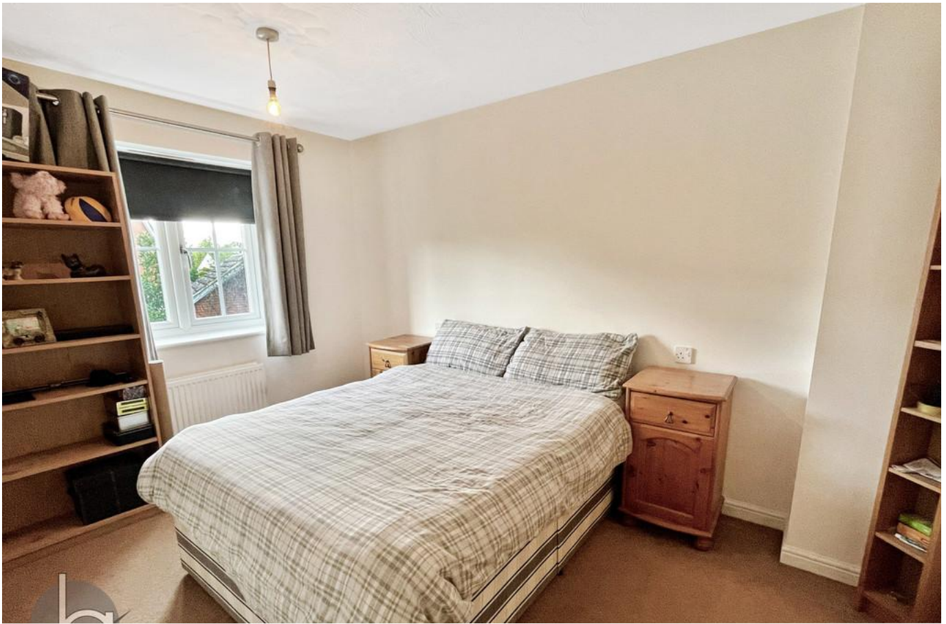
Wilkin Drive, Tiptree CO5 0QP